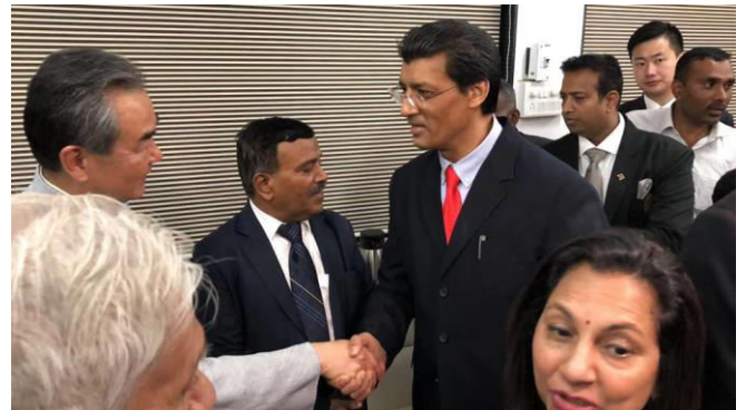
Prof. Deepak with Foreign Minister of China Wang

Prof B R Deepak delivered two keynote speeches during the first ever high level mechanism on people to people and cultural exchange between India and China on 20 th December in New Delhi and on 22 nd December during the Dialogue of Civilizations between India and China at Marathwara University. State counselor and Foreign Minister of China Wang Yi also graced the occasion.