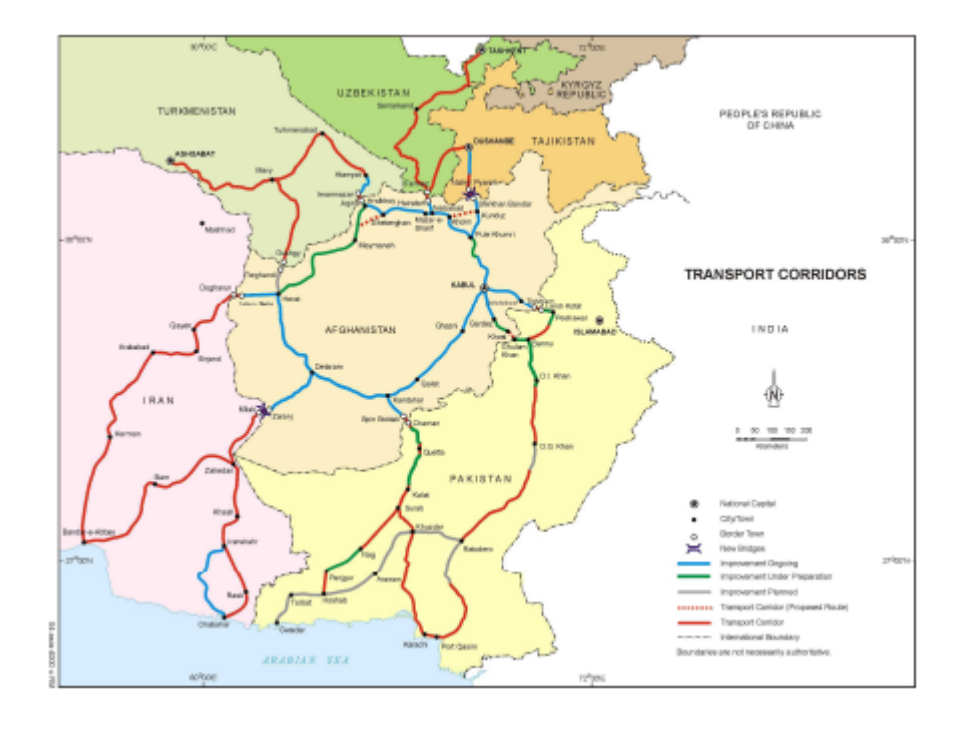
Figure 1: Transport Corridors: Greater Central Asia